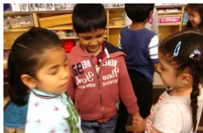
Rose Avenue PS, Kindergarten Class Participating in "Pass the Pulse" Pulse"

In schools, building relational trust with each student within a safe and caring school is the foundation for learning. Connection we know is at the core of effective teaching and its absence in a students' school life is at the core of most of their reported stress.