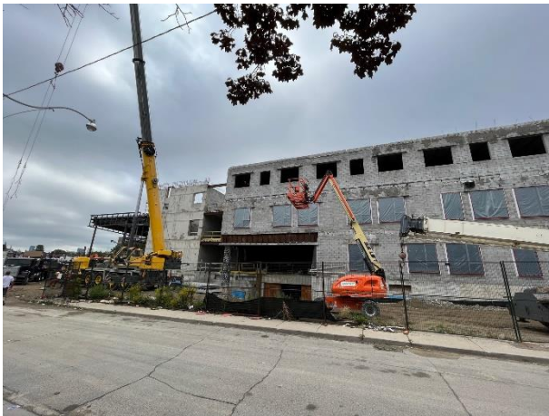
Picture take from the North elevation looking at the ramp to the underground garage.