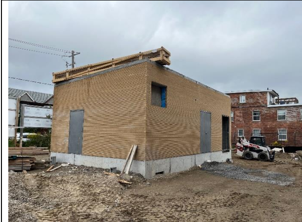
Picture taken of the transformer vault, located to the North-West of the new building. Installation of exterior brick was recently completed, and doors were installed.