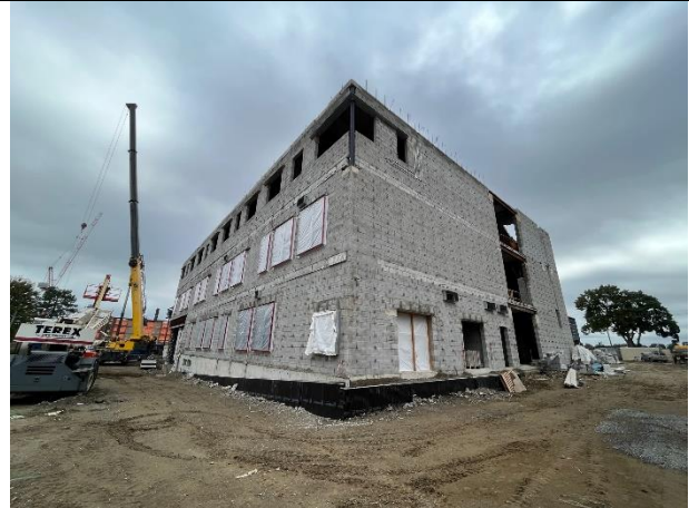
Picture of the North-West corner looking at the ALPHA II alternative school. Fourth floor core slab panels are currently being installed.