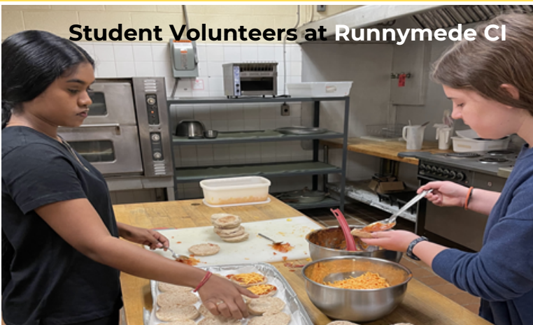
Student Volunteers at Runnymede CI

During the last 2 years, SNP's modified their delivery models and menus to ensure safety requirements were met. Happily, this September, most SNP programs have safely reopened and returned to pre-COVID practices as public health restrictions have lifted. Many schools are benefitting from student and parent volunteers, food preparation on site and less waste. Unfortunately, increased food costs are negatively affecting SNP's (and families) and access to food at school is more important than ever. Parent donations and additional support from our partner TFSS has helped schools to continue to provide fresh fruit, vegetables and other healthy snacks to students.