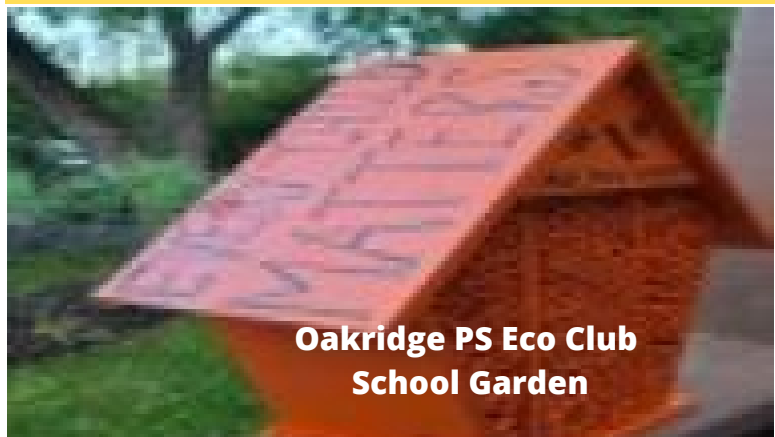
Oakridge PS Eco Club School Garden

In 2022-2023, public health inspectors will start their work with student nutrition programs by offering a consultation, rather than a food safety inspection, whenever possible. The purpose of the consultation is to understand how the student nutrition program operates and to keep it operating using safe food handling practices. An inspector will contact the Principal to arrange for a consultation. If, following consultation, changes to the program are required, a Public Health Dietitian will be available to support menu planning. Contact dinesafe@toronto.ca for food safety questions.